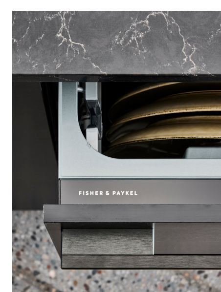
An extensive range of Fisher & Paykel appliances not only enhances the cooking experience but complements the refined design aesthetic.

Bordered by the Pacific Ocean to the east and Pittwater to the west in Sydney's Northern Beaches is the suburb of Newport. Its distinctive blend of urbanity and surf culture has rendered this coastal enclave a highly desirable place to live, and Qubec – a low density development by Nettletontribe Architects and Stable Properties – leans into the area's many attributes with ease.