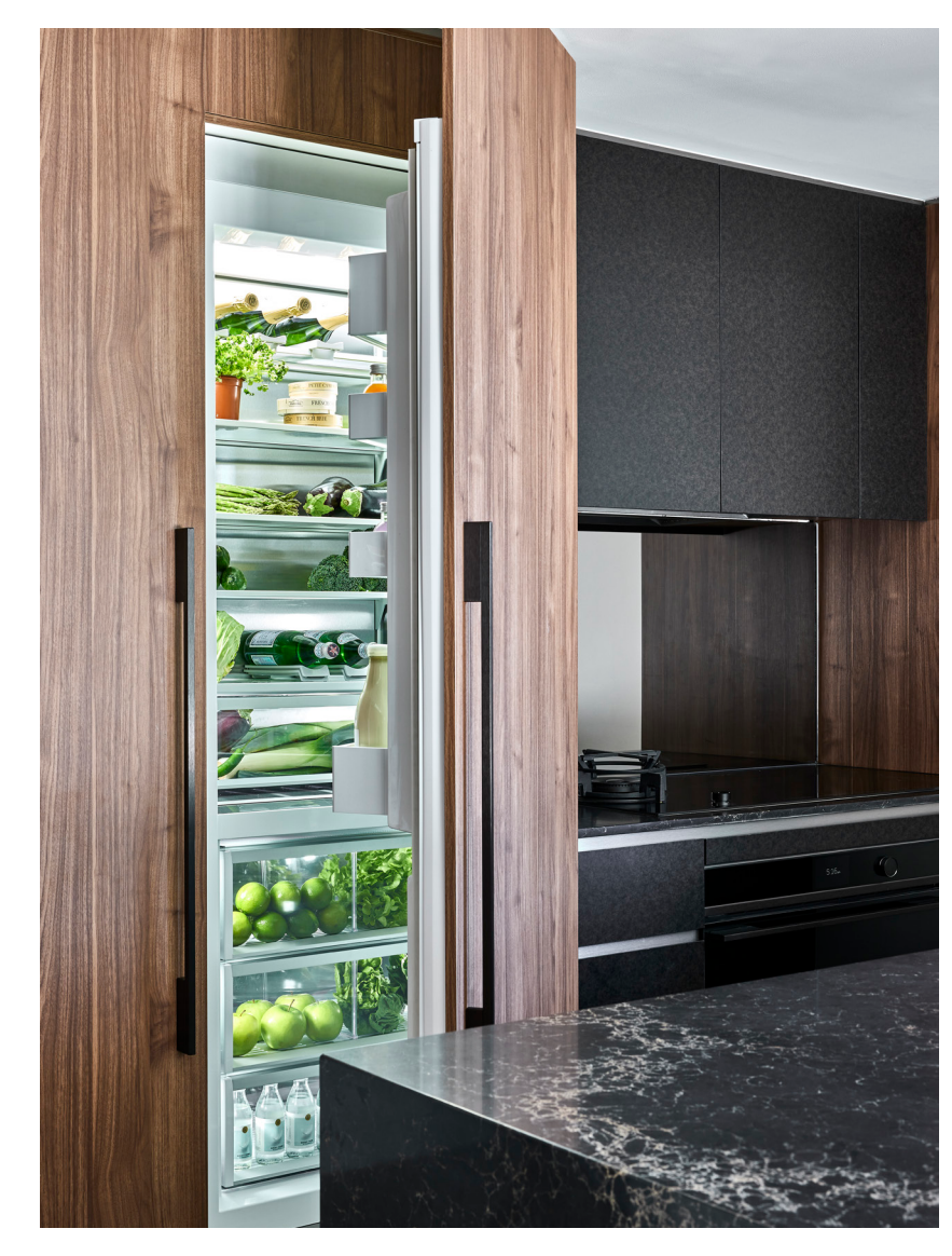
Concealed behind timber joinery, the Fisher & Paykel Column Refrigerator is a seamless addition to the kitchen

multi-residential • product ad @thelocalproject